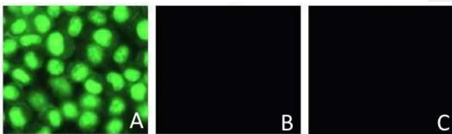
Fig 2. Images taken after 30 minutes of incubation with A) SYBR® Green I, B) Xpert Green DNA Stain, C) Xpert Green DNA Stain Direct. Whereas SYBR® Green can readily penetrate cells and then bind to and stain nuclear DNA, Xpert Green DNA stains cannot.